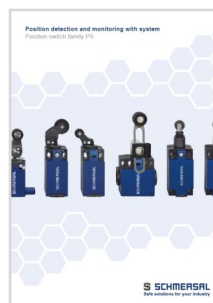
PS Series Brochure, 28 pages