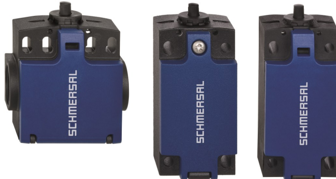
PS226 PS315 PS316