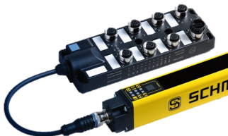
Muting sensor connection unit