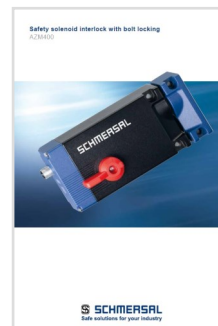
AZM400 Brochure, 10 pages