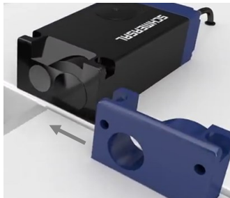
Motor driven locking bolt extends and retracts in switch