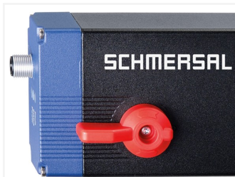
Emergency release knob (T) manually retracts bolt