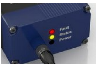
3 Color LED Display Green: Power, not actuated Yellow: Actuation Red: (Flashing) Diagnostic error