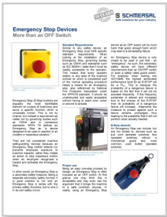
Whitepaper: Emergency Stop Devices Visit our website for a PDF Copy