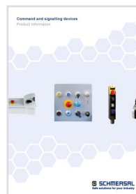
Command and Signaling Devices