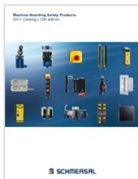
GK-1 Safety Products Catalog