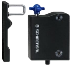
Electronic Solenoid Interlock