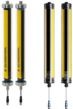
Safety Light Curtains and Grids