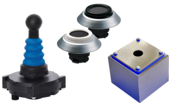
Joysticks, Pushbuttons & Enclosures