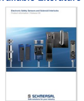
Electronic Safety Sensors and Solenoid Interlocks Catalog