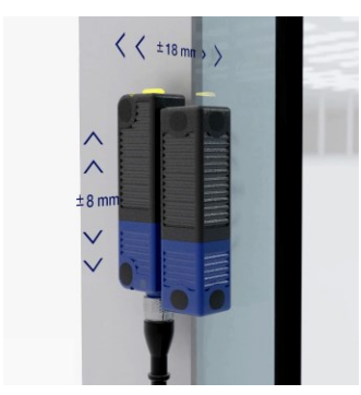
Flashing yellow LED signals actuator near switching distance limit.