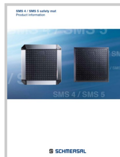
SMS4/5 Brochure, 8 pages