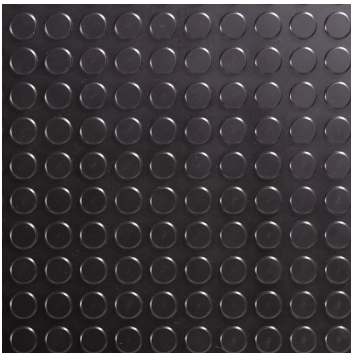
Standard non-slip tread pattern